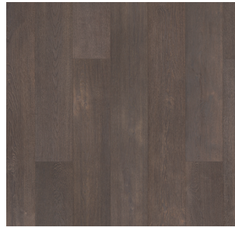
COUNTRY ROAD OAK | 878