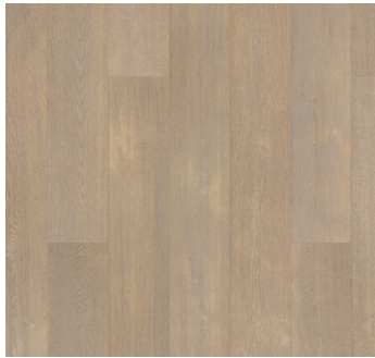
WICKER OAK | 938

Maximum waterproof protection for wet and steam mopping.