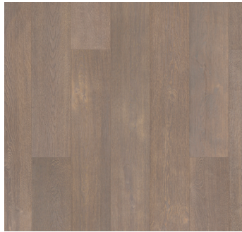
WORN LEATHER OAK | 852